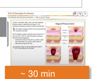
Image References: wavebreakmedia-ltd / Shutterstock; leonello calvetti / Shutterstock; Alila Medical Media / Shutterstock